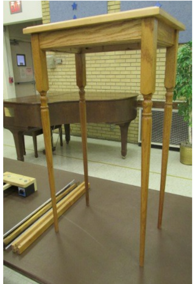
Band Saw pin guide with magnetic hold downs that can also be used as a magnetic featherboard built by Bill Tumbleson.

spied some stair spindles and a cabinet door and frame that he had laying around, and quickly created this table for his son in less than 2 hours. Assembly was aided by pocket holes.