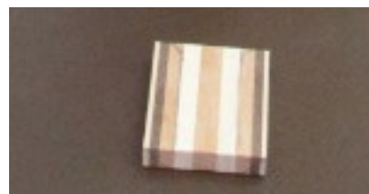
Glueup used to make vase

Three legged stool with tapered wedged tenons and concave seat area by Jerry Carpenter; He explained his use of a special cutting device to cut the tapered tenons and a tapered boring tool to make the matching tapered mortises. He also explained how he did the concave seat using lots of elbow grease with a scorp tool.